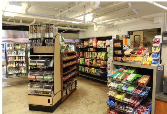
Below Goody's Burrito shop, you will find its Market! There is a wide variety of snacks to choose from that will fulfill any cravings. It is also opened late for those long nights of studying.

“None of us got to where we are solely by pulling ourselves up by our bootstraps. We got here because somebody... bent down and helped us pick up our boots.” -Thurgood Marshall