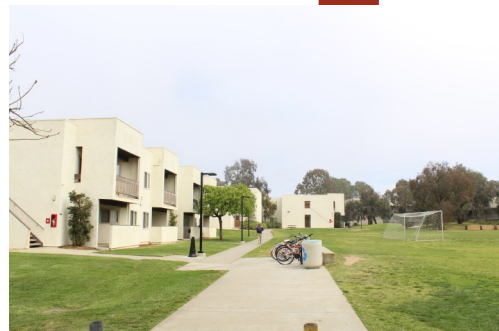
This is the pathway that leads from Ocean View Terrace and into the Upper Apartments! The uppers are one story apartments located next to Marshall Field and Goody's Place and Market. In addition to the uppers, Marshall also offers housing in the Residence Halls, where first-year students tend to live. There are also the Lower apartments which are located near Fireside Lounge, as well as a quick walk to the center of campus, Price Center.