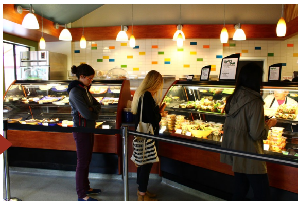
Another spot to eat at Marshall College is Goody's Place and Market. It is named after Thurgood Marshall's nickname "Goody." It is best known for its fulfilling burritos and bowls. There is also a deli side that features a variety of sandwiches and a walk-up window for coffee drinks.

Know Yourself. Check Yourself. Be Yourself.