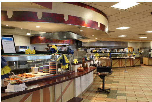
This is the inside of Marshall College's very own dining hall, OceanView Terrace! There is a wide variety of food to choose from. From salads to sandwiches to soups and daily specials like stir-fry, pasta, and quesadillas, OVT has food for any and all taste buds and appetites!