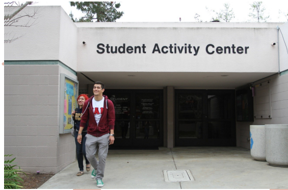
Student Activity Center

Do Ho Suh's Fallen Star is the 18th permanent sculpture commissioned by UCSD's Stuart Collection. It reflects Suh's on-going exploration of themes around the idea of home, cultural displacement, the perception of our surroundings, and how one constructs a memory of a space. Suh's small "home" has perhaps been picked up by some mysterious force and appears to have landed or crashed onto the seventh floor of Jacobs Hall at the Jacobs School of Engineering.